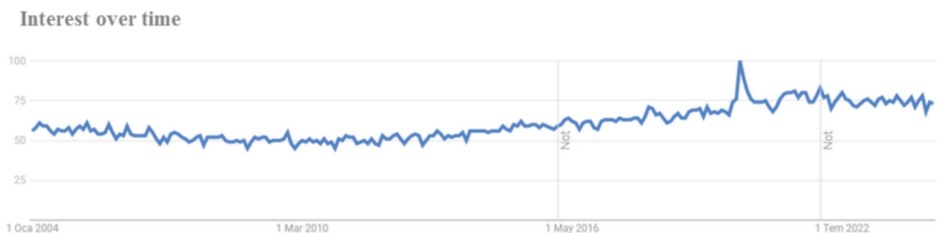
Figure 1. Temporal change in search frequency for the term "fibromyalgia"

FM significantly impacts individuals' lives, often manifesting as chronic widespread pain, sleep disturbances or non-restorative sleep, physical exhaustion, and cognitive difficulties.